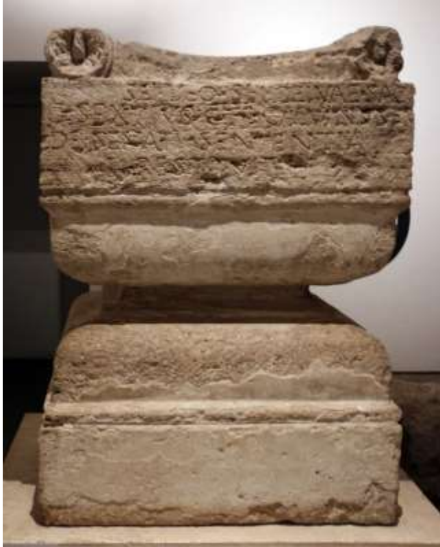
"An Altar to the Unknown God" at a museum in Rome

Paul's words in Acts 17 give some context to this prayer. It's part of his sermon to the people of Athens, who worship a whole bunch of gods and goddesses as statues within their temple. Paul points out that one of these statues is "an altar with the inscription, 'To an unknown god'" or goddess (v. 23). And Paul claims to be there to tell