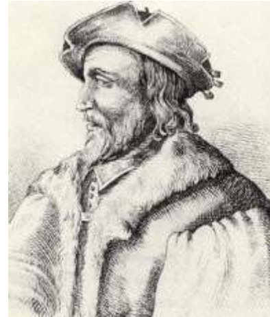
Balthasar Hubmaier (1480-1528)

Please join us for the potluck meal after the service.