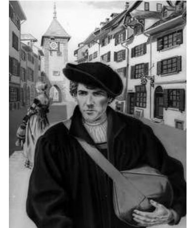
Hans Denck (1500-1527)